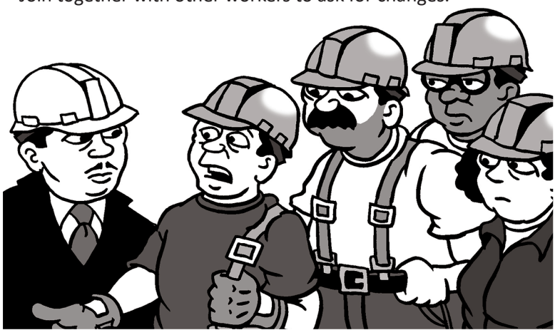
You can join with other workers to ask for changes.

The law says it is illegal for employers to threaten or retaliate against you for taking these actions.