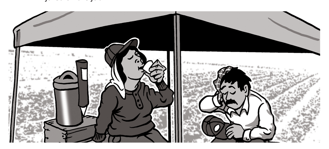
Employers must provide what is needed to keep you safe.