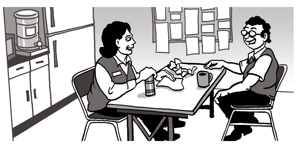
You have the right to take breaks.