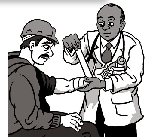
If you are injured, you have the right to medical care.

Ask for medical help right away. If it's an emergency, call 911 or go straight to an emergency room.